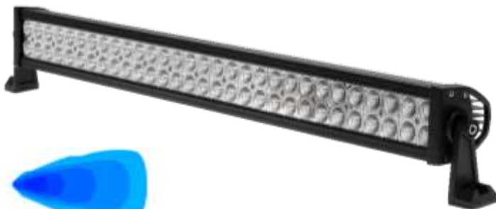
Flood Light Pattern

Off-road straight LED light bar ideal for installation on all makes of ATV's, off-road, agricultural and industrial vehicles.