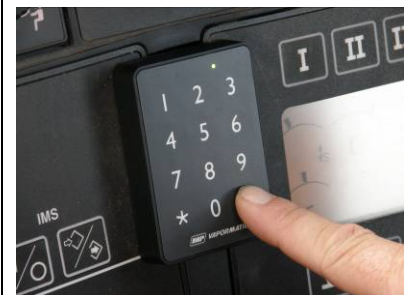
Up to 6 unique PIN access codes for multiple drivers