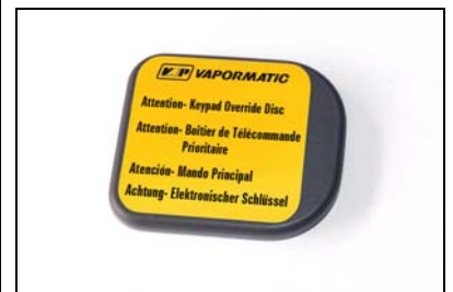
Keypad Override disc

Contact your Vapormatic Territory Manager or head office sales (01392) 684000 for further details.