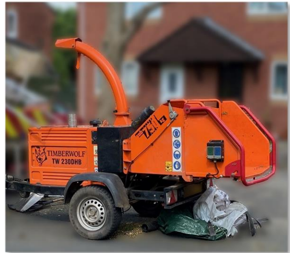
Example application : Timberwolf towed chippers